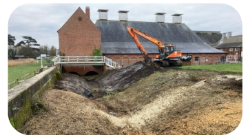
Environmental mitigation work at Snape Maltings. February 2025.

Start Date subject to ongoing fund raising