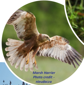
Marsh Harrier