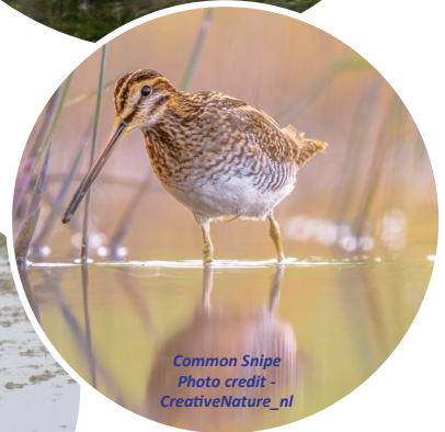
Common Snipe