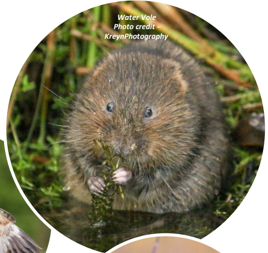
Water Vole

A bespoke approach is needed to manage Water Vole mitigation across all flood cells and requires a licence from Natural England. We've worked with specialists and will soon submit our final application. Habitat enhancements in FC06 and FC07 are ongoing, with further work planned.